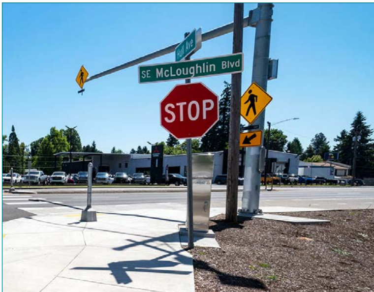
ABOVE: An example of an enhanced crossing, also known as a rapid flashing beacon.